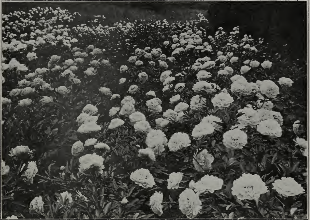
Triomphe de l'Exposition de Lille and Marguerite Gerard